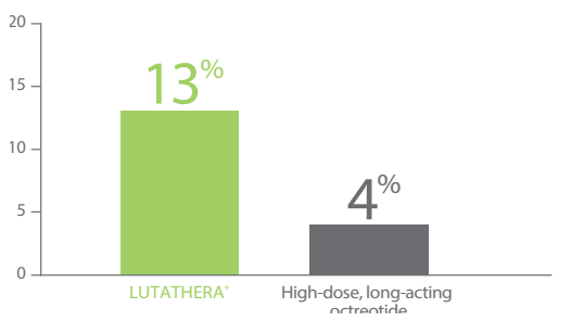
More patients treated with LUTATHERA® had their tumors shrink compared to patients treated with a larger than normal dose of long-acting octreotide¹

LUTATHERA® reduced the risk of cancer spreading, growing, or getting worse by 79% compared to a larger than normal dose of long-acting octreotide¹